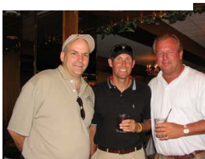
CRCA Reception & Dinner