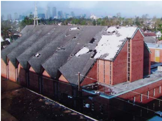
Hurricane Katrina Floods St. Mary's