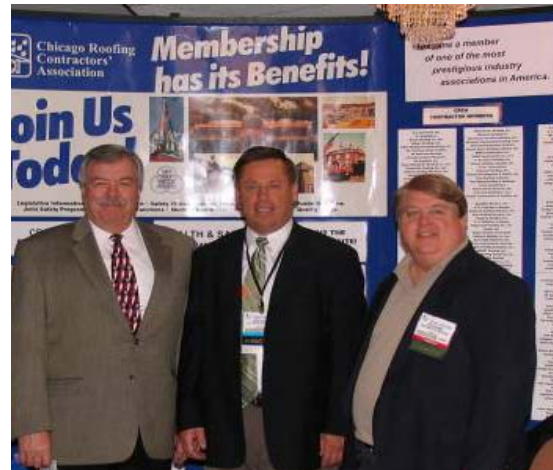
CRCA Trade Show Committee

~ NRCA Spec Right Seminar for Contractors – NRCA recently launched its SpecRight Program Contractor Training Sessions. These programs are focused at training contractors to gain a competitive edge by helping customers save money by lowering their energy costs. The seminar will teach attendees how to use NRCA’s EnergyWise Roof Calculator software to illustrate how insulation costs can be recouped through energy savings. Info about the latest trends in energy codes, ASHRAE 90.1, the Chicago Energy Code and California’s Title 24 and ‘cool roofs, green