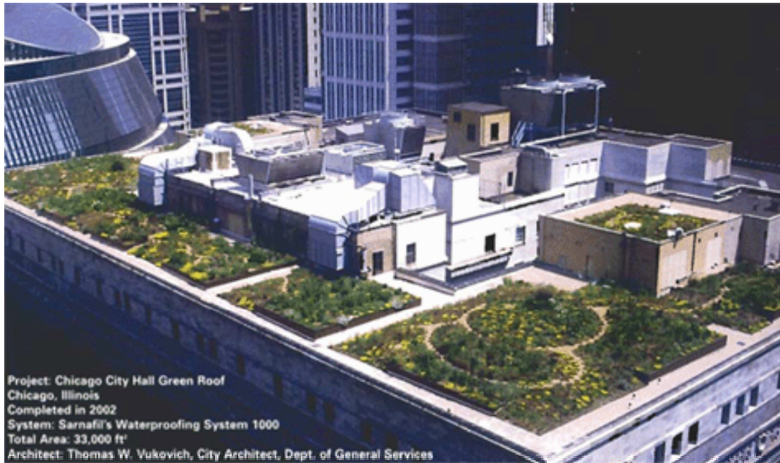
Project: Chicago City Hall Green Roof Chicago, Illinois Completed in 2002 System: Sarnafil's Waterproofing System 1000 Total Area: 33,000 ft 2 Architect: Thomas W. Vukovich, City Architect, Dept. of General Services