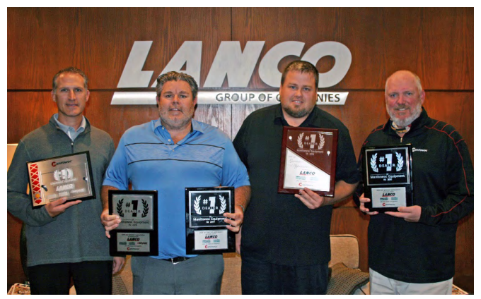
Walter Payton (Lanco) photo

As one of the Lanco companies, Walter Payton Power Equipment has a long history of serving Chicago and is a supplier of new, used, and rental boom trucks, articulating cranes, and trailers from National Crane and Grove as well as brands such as Manitex, PM, Manitou, Liftking & Talbert.